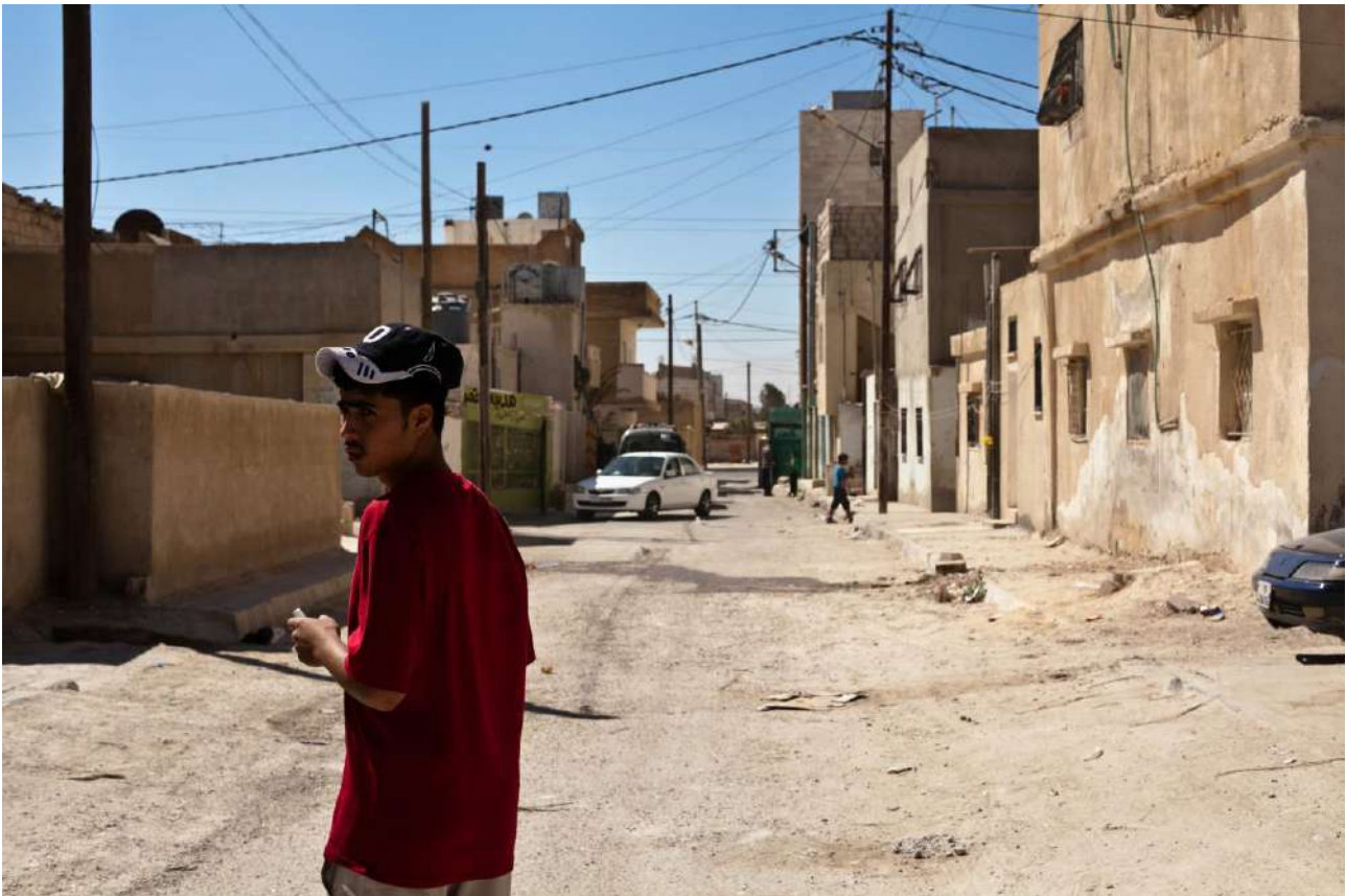
The UNRWA camp of Talbieh, Jordan

to a structural lack of reliable data on urbanisation and cities in the global south, namely in Sub Saharan Africa 70 , where national authorities use a wide range of different parameters to define cities, such as administrative units or statistical areas, and often overlook informal urban areas. For example, in Cameroon where over one million people are now internally displaced and over 400,000 refugees from Nigeria and the Central African Republic hosted 71 , settlements of a few thousand inhabitants are defined as urban 72 . This can distort the analysis of urbanisation rates nationally and its comparability across neighbouring countries.