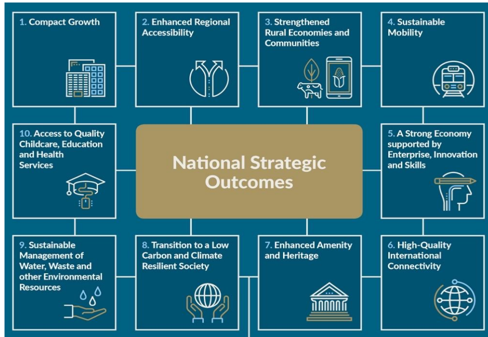
Figure 1 National Planning Framework's National Strategic Outcomes 2 .

The Measuring What Matters: Planning Outcomes Research Irish Toolkit has been contextualised using the Irish Government's National Strategic Outcomes 2 . These are a spatial expression of Ireland's National Outcomes, which in turn are a national expression of the UN Sustainable Development Goals 1 . The alignment shown below is about both direct and indirect contribution.