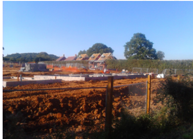
Above: Housing development in the West Midlands Green Belt

People knowing about and being interested in Green Belts is probably overall a good thing in terms of engaging people in planning. However, arguably more planning education is required. Ideally, this would be in the National Curriculum for Geography to increase public awareness of planning from a young age. Nevertheless, as a minimum, both local and national politicians should receive planning training. Another brilliant idea is the 'Planning School' lecture series for the public which is supported by the London Society.