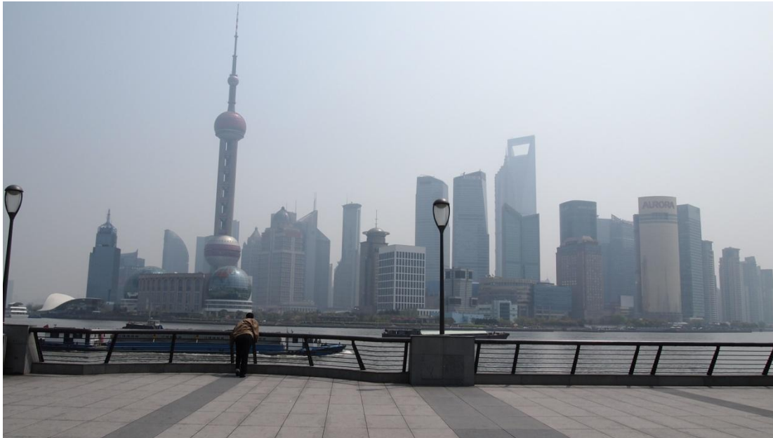
Figure 6. The Pudong new district of Shanghai, seen from the Bund.

benefitting the wider Yangtze River Delta Region. In 2006, the biomedical cluster in Zhangjiang counted 240 companies, over 15,000 employees, 110 granted patents as well as 6.42 billion Yuan output value (Zhang and Wu 2012).