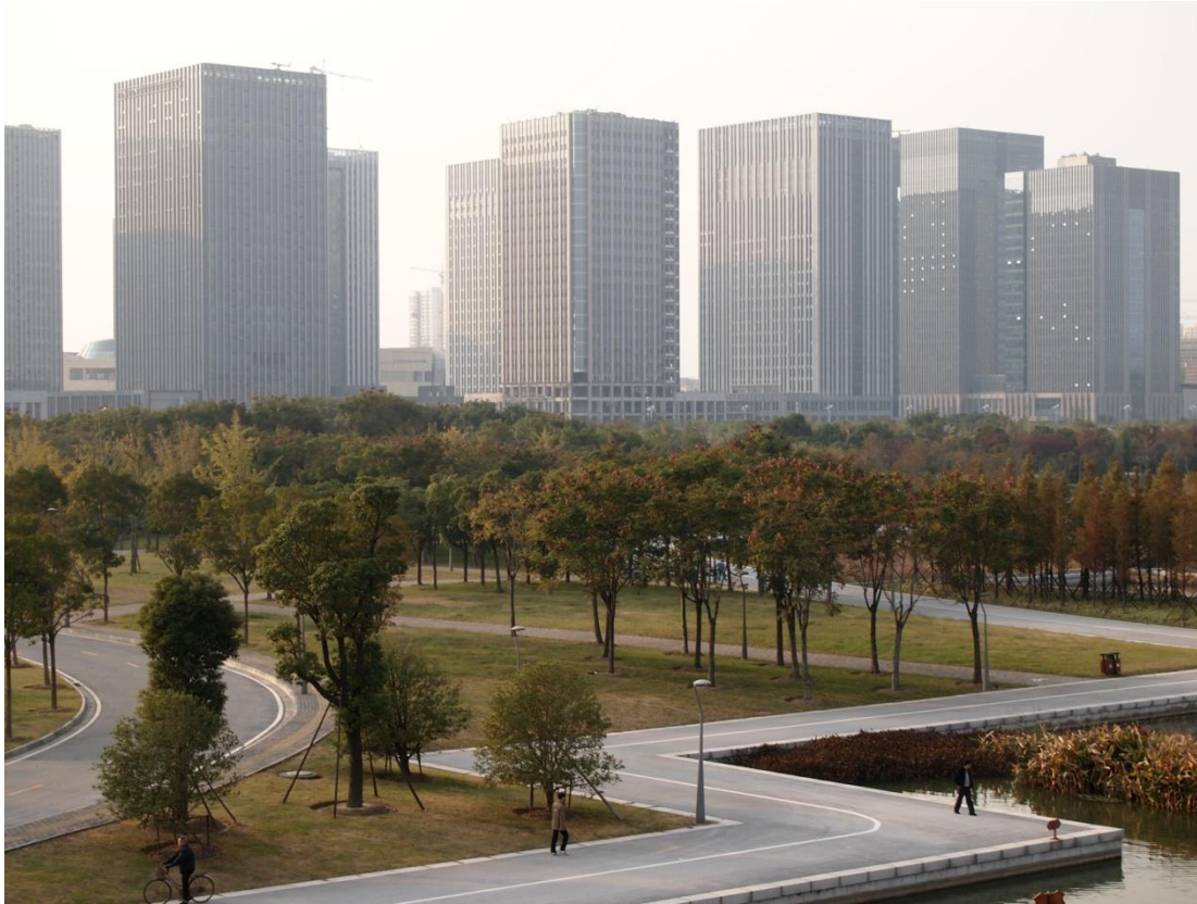
Figure 4. The central business district of Wuxi Taihu new town.

residents and 500,000 jobs with a high density CBD at its centre (Figure 4). Like most other new towns in China, the new town in Wuxi Taihu had a considerably higher density compared to new towns in Britain. There were two key actions that the newly founded Wuxi New District government took, which allowed Wuxi Taihu new town to be more successful than many other new town developments.