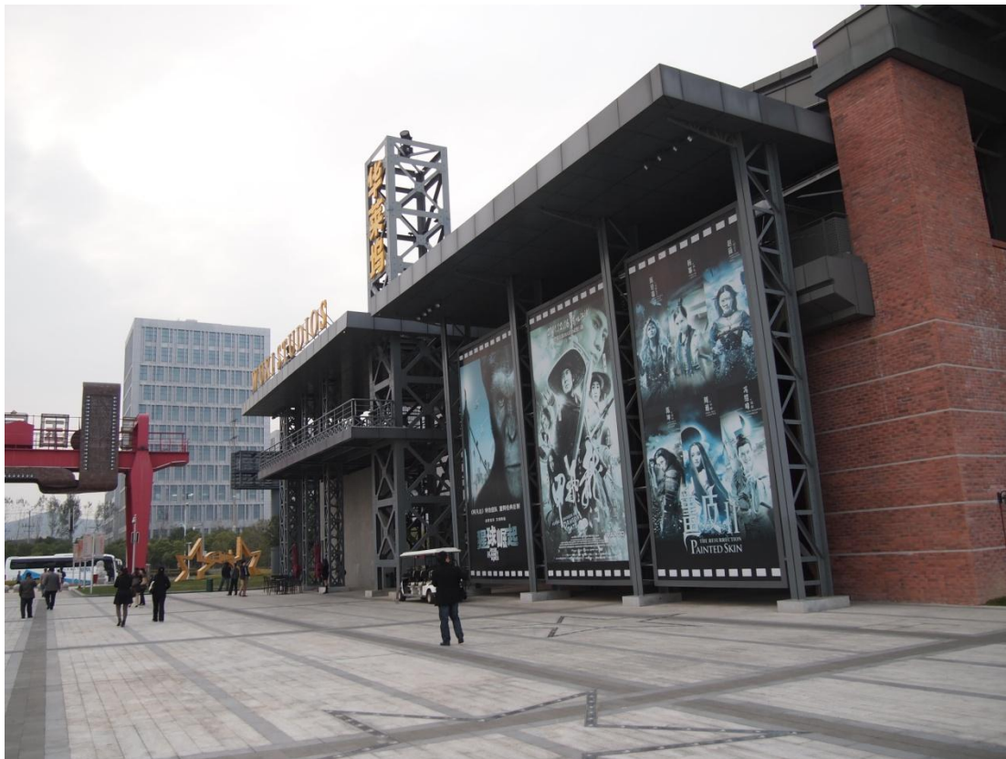
Figure 5. The film studio based in Wuxi Taihu new town.

bypass several administrative ranks and directly receive the support of the national government as well as attracting international attention. Furthermore, compared to some large and costly eco-city schemes such as Dongtan, the introduction of green building technologies to the pilot area would only increase the building cost by 10 to 20 per cent and thus not impede on the economic viability of the project. More importantly the area managed to attract numerous industries including large film studios to move to Wuxi Taihu and thus solving the employment problem of many of its residents (Figure 5). The Wuxi Taihu new town project is an exemplar of how it is possible to create values such as housing developments and new employment by adopting a pro-growth planning approach.