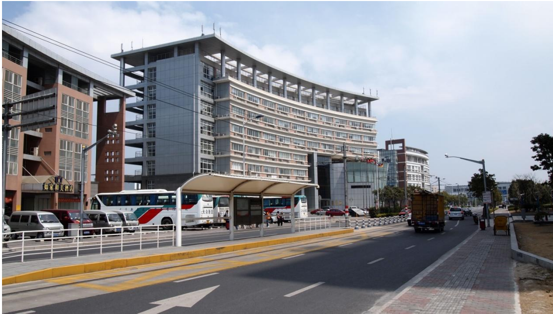
Figure 7. The incubator of Zhangjiang High-tech Park.

In addition, from the rising revenues from land development, the Shanghai government also invested heavily into venture capital high-tech companies located within the high-tech park. Thus, the Shanghai municipality was able to develop Zhangjiang High-tech Park with virtually no initial capital. This model of land development has already been mentioned in the Kunshan case study and is a common and widely adopted method for local governments to initiate their land development. However, land sale was not the only way planning was used to enhance the growth of Zhangjiang High-tech Park. The 'Focusing on Zhangjiang' policy allowed the local government to treat Zhangjiang as a special cluster and concentrate its resources on its growth. This included a series of preferential tax measures and in addition the policy, granted special autonomy to the governance of Zhangjiang High-tech Park, thus streamlining bureaucratic complexities and reducing administrative hurdles. Moreover, the designation of a high-tech zone also significantly increased the competitiveness of all companies located in Zhangjiang. For instance, the recent facilities of on-site provision custom clearance facilities significantly increased the efficiency. Furthermore, residential units are also provided in order to accommodate the needs of the staff.