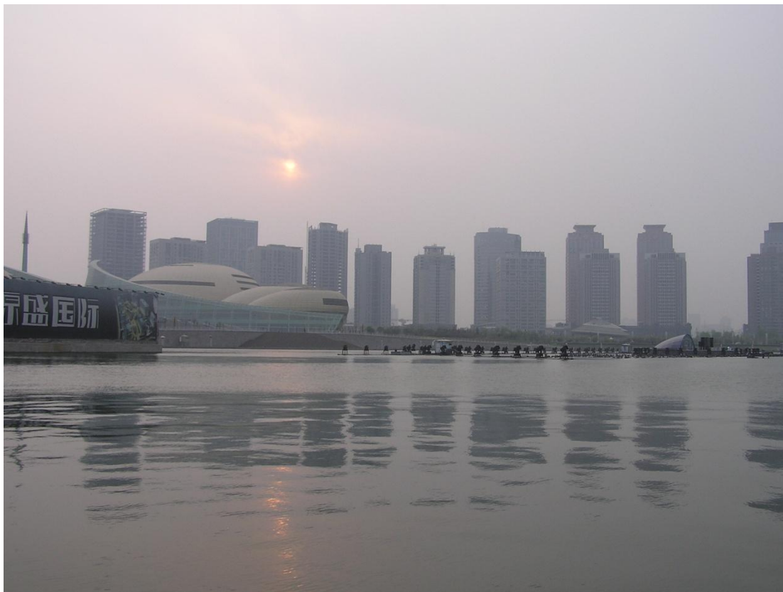
Figure 2. The central area of Zhengdong new district, where a Conventional and Exhibition Centre has been built.

The relocation of a military airport was a good opportunity to introduce Zhengdong New District, which ultimately added an additional 150 square kilometres to the existing 133 square kilometres of urban built-up area in Zhengzhou (Wu 2015:93). In an environment where many cities strived to attract investments through financial incentives and strategic plans based on grand visions, the Zhengdong New District plan stood out from its peers by adopting a design-led master plan. In 2001, the municipal government launched a design competition for the master plan of Zhengdong new district, which the well-known architect Kisho Kurokawa won. The scheme developed by Kisho Kurokawa placed great emphasis on design and morphology and envisaged a cluster of over 60 high-rise buildings surrounding the CBD area as well as an artificial lake in the centre (Figure 2). This design-led plan making greatly differed from conventional masterplans, which only focused on land-use allocation and the connection between different functional areas. In addition, the great visual effects helped the development to convey the visions of the local government in a very effective manner.