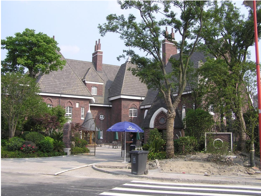
Figure 3. The cosmopolitan landscape in Songjiang new town. Here the Thames Town shows a British market town style.

The Songjiang development corporation was in charge of the carrying out the initial plan and development tasks including detailed design, land acquisition as well as the construction of infrastructure. For the construction of the actual residential units as well as the town centre and commercial areas, it was private companies that provided both the financial capital and carried out the development. The development corporation itself was responsible for constructing other local facilities including schools, supermarkets, an art gallery, an exhibition centre and a sports centre. Since its completion, the sale of properties was very successful due to Songjiang's marketing strategies and the provision of sufficient infrastructure (such as the extended metro line). Both the local government and the private developers gained substantial profits from the Songjiang new town project (Shen and Wu, 2012a). Songjiang caters to a very broad spectrum of the population including rural migrants, white-collar families as well as affluent households (Shen and Wu 2013).