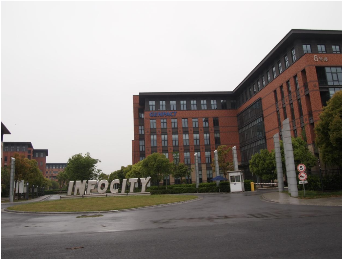
Figure 1. The development of electronic manufacturing industries in Huaqiao new town of Kunshan, near Shanghai.

Another major thrust of developments was initiated by foreign industries from Taiwan, specialising in labour-intensive manufacturing industries (Wu 2015). The second major factor that determined Kunshan's economic success was its more flexible governance as the city's lower administrative rank enabled more autonomy from the central government. Due this reason, Kunshan also had more freedom in devising strategic plans and freeing up industrial land to attract investments. The Kunshan development zone is a good example of the entrepreneurial approach of local leaders as it was an entirely self-funded development that was introduced without the approval of the upper tiers of government and only acquired its formal status by the central government several years later (Chien 2007).