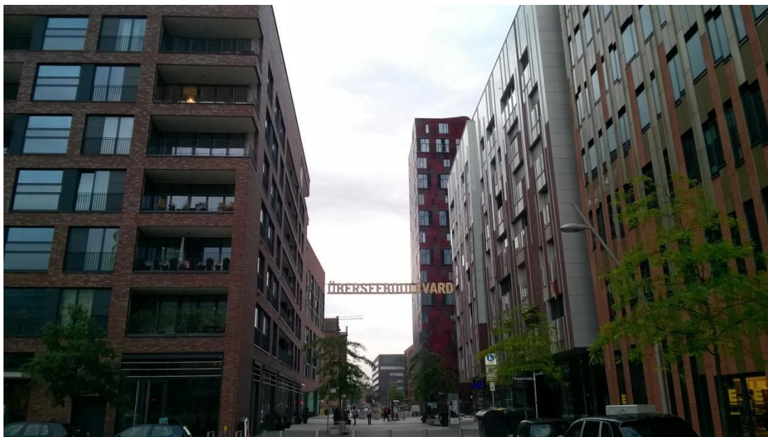
Figure 1: HafenCity's urban layout is almost entirely built out from scratch.

Resulting in part from Hamburg's shortage of housing and the city-state's decision to only situate new housing development on brownfield sites inside its boundaries, the HafenCity concept was presented by the city in 1997 as an entirely new district of Hamburg that would expand the existing city centre area by 157 hectares (HafenCity Hamburg GmbH, 2015).