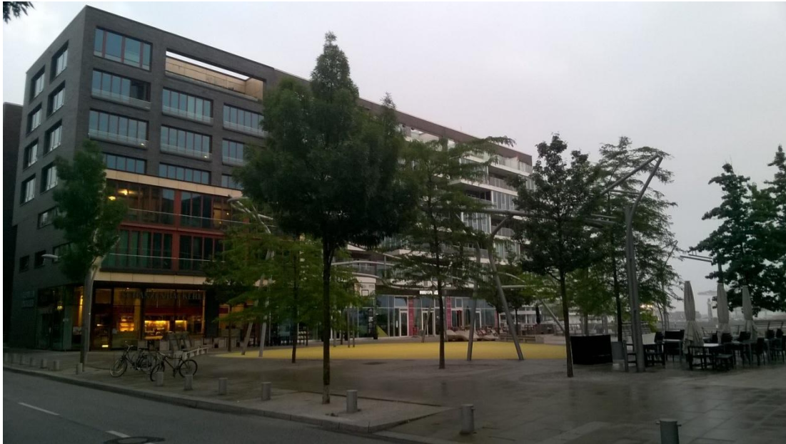
Figure 2: generous provision is made for public space in the City State-authored plans.

HafenCity Hamburg GmbH is operationally independent of its owner, Hamburg City State, and is formally responsible for the development of HafenCity, acting as the partner for private sector investors and developers as well as state and third sector agencies, while being the trustee of the City and Port special fund. The City State's role, in addition to its capacity as funder, is to use legislative and policy measures to enable HafenCity Hamburg GmbH to function effectively. A state commission within the City State is responsible for the approval of development plans, urban design guidelines, and building permits.