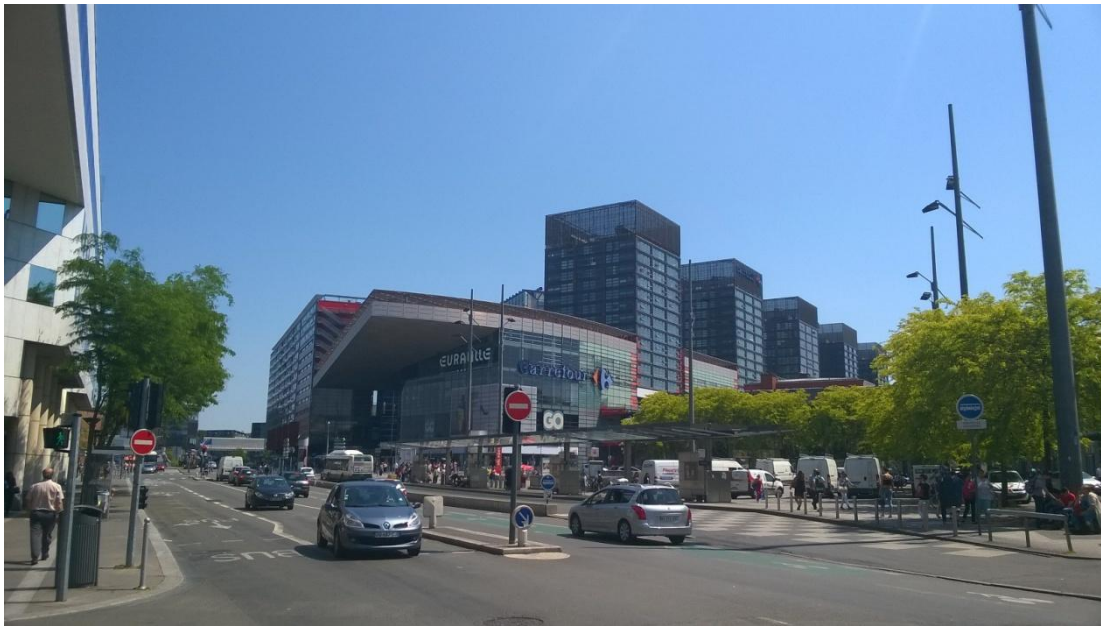
Figure 3: The Euralille office and retail development, located adjacent to the high speed station that lies on the London-Brussels and Paris-Brussels routes.

Prior to being selected to become a métropole d'équilibre , Lille-Roubaix-Tourcoing had been designated in 1966 as one of 14 Communautés Urbaine , or metropolitan authorities, as a solution to the difficulties of governing what was effectively a single contiguous urban region using a proliferation of communes. It has since become a state requirement to cooperate at the inter-communal level, with a number of different models of Établissement Public de Coopération Intercommunale (EPCI) available. As a metropolitan authority, as opposed to a metropolitan government, the Communauté Urbaine de Lille (CUDL), which in 1996 became the Lille Métropole Communauté Urbaine (LMCU) and in 2014 the Métropole Européenne de Lille (MEL), was not a directly elected body and was governed by an assembly of commune councillors who had been nominated at commune level. The original responsibilities of the CUDL were in public transport, waste management, water, and street and traffic management, though over time its responsibilities became more extensive.