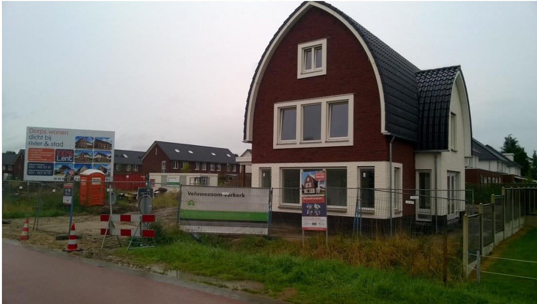
Figure 6: Housing in Waalsprong, Nijmegen. This VINEX location was due to have been completed by 2015 but is presently less than a third complete.

Despite this form of private-public cooperation the long term future of the model was called into question by the 2008 financial crisis. While private developers had sold land to municipalities with an exclusive option to build attached to the sale the option was not compulsorily binding. As a result, municipalities found themselves with ownership of significant quantities of land purchased from developers on the basis of debt finance but over which the associated developers had very little appetite to exercise their option. Municipalities across the Netherlands have found themselves millions – in many cases hundreds of millions – of Euros in debt since the beginning of the crisis, wiping out value captured from development built up over the preceding two decades and in some cases pushing them close to bankruptcy (Kuijer interview, 2015).