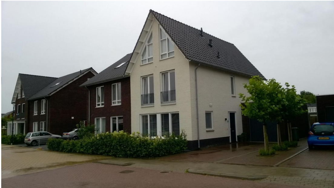
Figure 5: typical VINEX housing in Waalsprong, Nijmegen.

During the VINEX programme the public land development model ran into difficulties. While the basis of the model lay in the ability of municipalities to purchase land at the rural-urban fringe at close to agricultural prices the announcement of the VINEX locations prior to the public purchase of land allowed private developers to step in and buy land ahead of the municipalities, confident that planning permission would be granted for these sites subsequently. While it might be expected that developers would use their position to either fully develop the land without state involvement or to sell the land to the municipalities at an inflated value, however, interviewees suggest that, so accustomed had developers become to the state acting as the first mover that in many cases they were buying land in areas where consent was to be given simply to obtain the right to develop. Research shows that what would have been speculative land acquisition under other planning systems was not always capitalised on by Dutch developers. Priemus and Louw (2000) (referenced in Priemus and Louw, 2003) note that in many instances developers either bought land in cooperation with a local authority or sold their land to a local authority at a loss, providing that an exclusive option to build was granted.