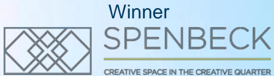
The Birkin Building