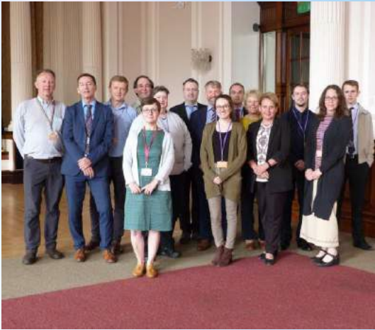
Winner Derbyshire County Council

Derbyshire County Council presented a strong case to win this year's award.