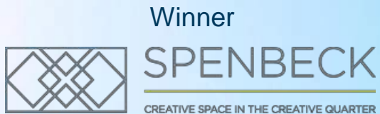
The Birkin Building